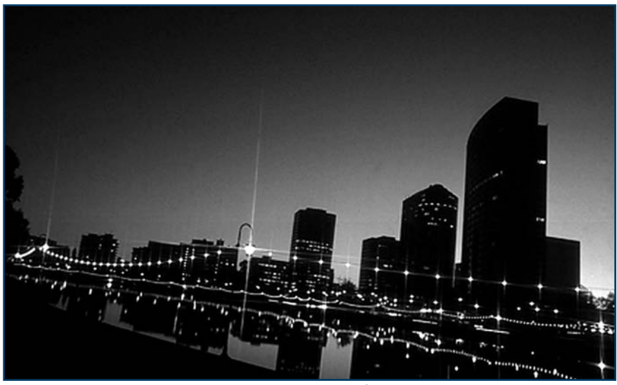
Oakland Skyline at Night