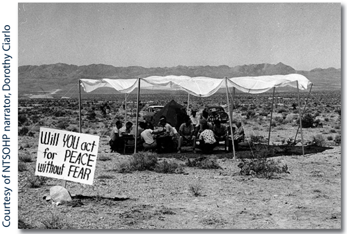
The first protest at the Nevada Test Site, 12th Anniversary of Hiroshima and Nagasaki, August 1957

The NTSOHP's mission was to conduct, preserve and disseminate oral histories of persons affiliated with and affected by the U.S. Cold War nuclear testing program in Nevada from 1951-1992. The testing program was a continuation of the World War II Manhattan Project, the Allies' top-secret program to develop an atomic weapon. On July 16, 1945, Manhattan Project scientists conducted the world's first atomic test, codenamed Trinity, near Socorro, N.M. Less than a month later, the U.S. dropped atomic bombs on the Japanese cities of Hiroshima and Nagasaki and within days, World War II ended.